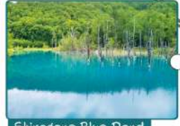
Shirogane Blue Pond

Biei Shirogane Ranch It is managed by the Biei Shirogane Ranch Management Council. You can enjoy a magnificent panoramic view of the Tokachi Mountain Range from the road on the north side of the ranch. The ranch grounds are not open to visitors. Please enjoy the panoramic view outside the ranch.