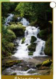
Shirogane Fudou-no-taki Falls

It is a 25m-high terraced waterfall where underground water gathers from around Mt. Tokachi-dake and falls through the rocks. Unlike the "Shirohige-no-Taki Falls", the water temperature is low, and even in summer it is cold enough to make one's hands tingle when dipped in it. The stone Buddha statues of the 88 temples of Shirogane's new Shikoku province are also lined up. Forming one of outstanding scenic spots in Shirogane area.