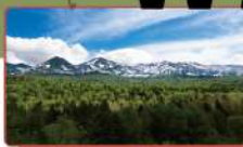
Mt. Tokachi-dake Mountain Range